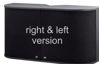
right & left version

***1m free field, pink noise, crest factor 10dB, with TD-8000 and ELITE-602SPL controller setup